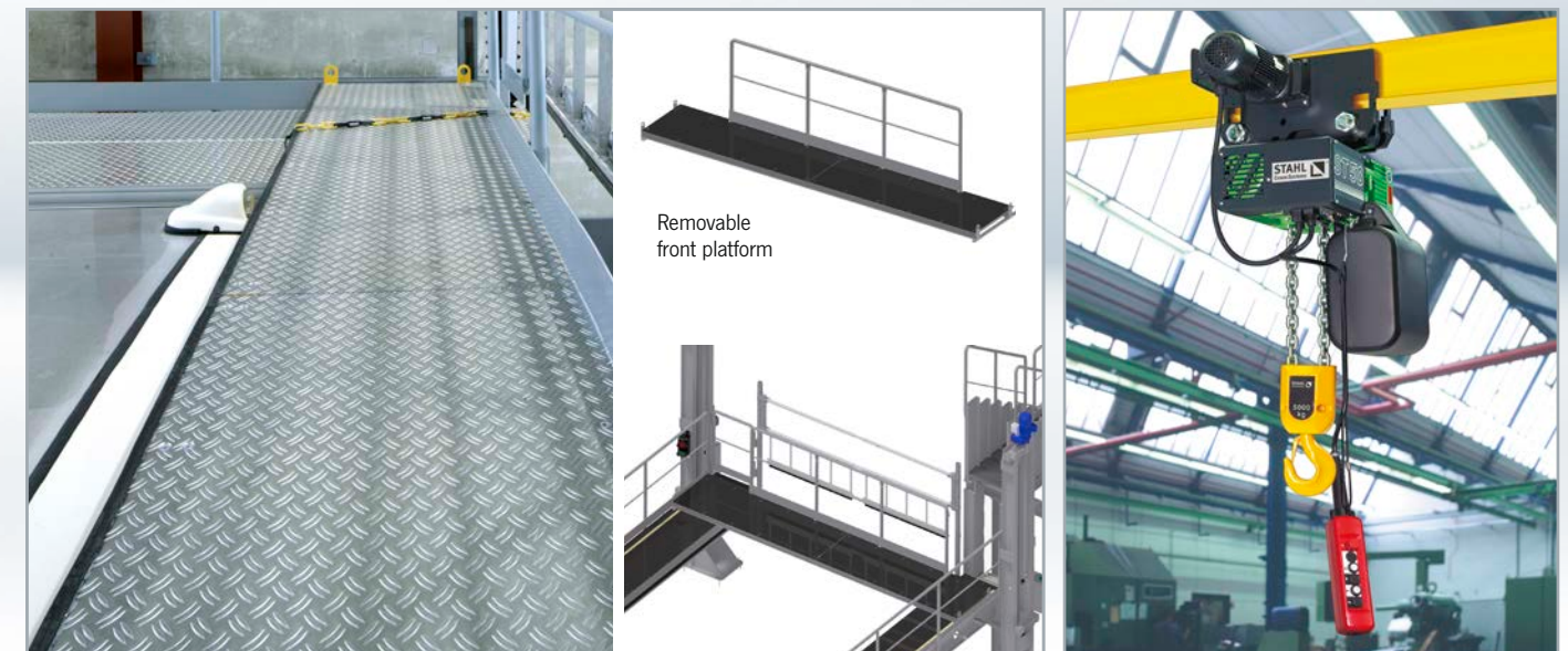
Removable front platform: Employees are also secured during maintenance of the front and rear of the vehicle.