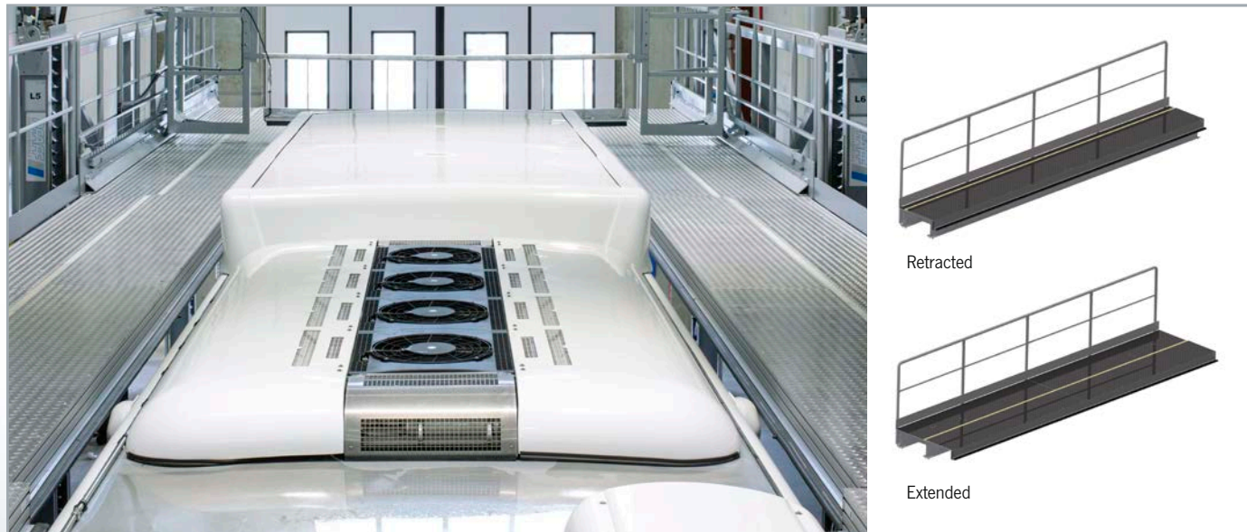
Extension elements: individual segments of 3 to 9 meters in length.