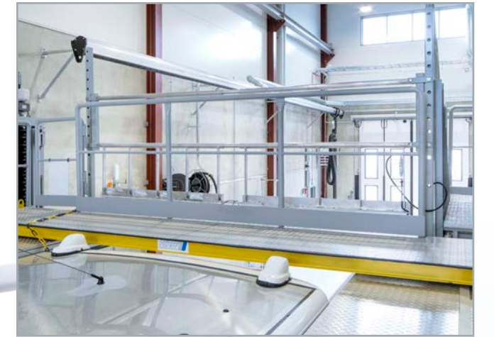
Safety equipment at the ends of the platforms: Adaptable to the length of the buses.

Another important effect of the safety measures: Short set-up times ensure a quick turnaround of the vehicles.