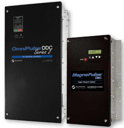
OmniPulse™ DDC Series 2 and MagnePulse DMC

You can be assured that Magnetek will continue to be the leader in crane control technology, and the first to bring you innovations to improve the performance of your overhead material handling system.