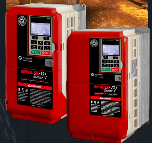
Industry-Leading Variable Frequency Drives