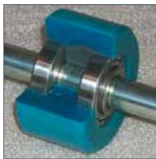
Rollers with ball bearing