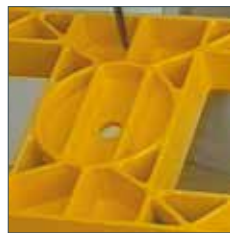
Chassis from ductile graphite iron