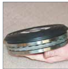
Ball bearing for turning plate